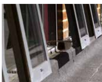
14 Window Sill