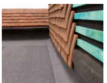
8 Hanging Tiles