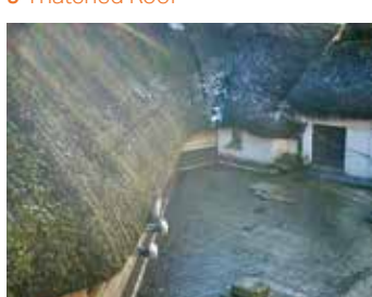
9 Thatched Roof