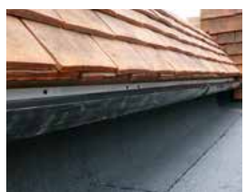
4 Flat roof meeting pitched roof