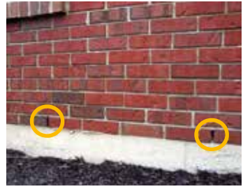
5 Open Perpends