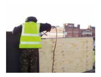
7 Timber Upstands