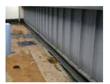
13 Confined Space