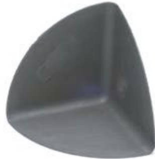
TPE Internal Corner L95