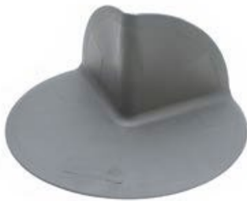
TPE External Corner L95