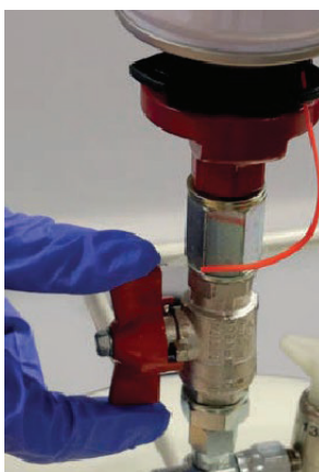
Image 11 Turn the tap on