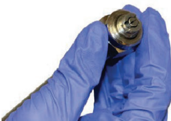
Image 3: Attach the spray-tip