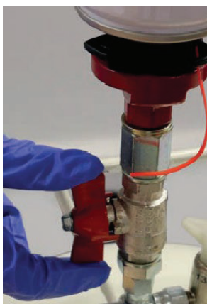
Image 11 Turn the tap on